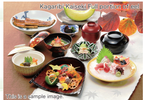
This is a sample image.